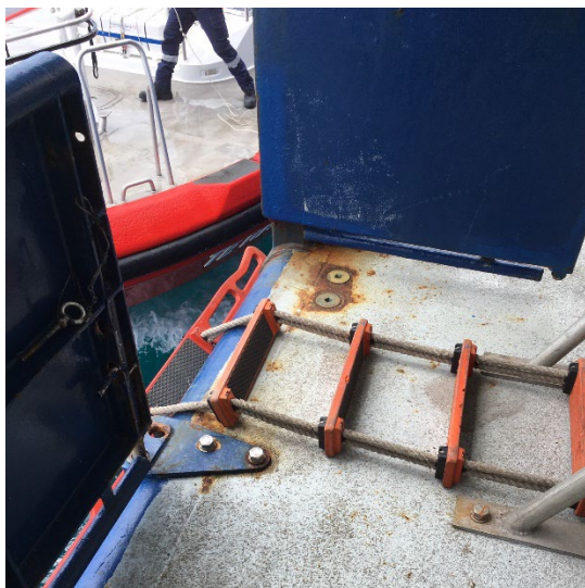
Figure 13 – No stanchions provided to assist pilot boarding