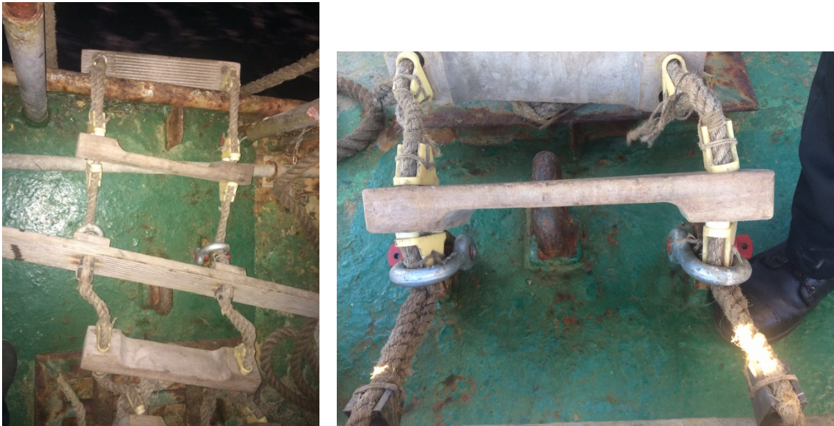
Figure 1 – Well-worn ladder with shackles impacting against the side chocks

So, we now have a ladder with two lengths of side rope on deck, and the length of the rope from the top step gives sufficient flexibility to allow the ladder to be raised or lowered a few metres. Surely it is a simple enough matter to lash these securely to an eyebolt? Sadly, in many cases it seems that it is easier to jury rig arrangements which are non-compliant and often downright dangerous, as shown in the following examples: