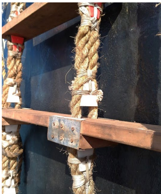
Figure 12 – loose chocks – spreader replaced and not constructed of one piece of wood