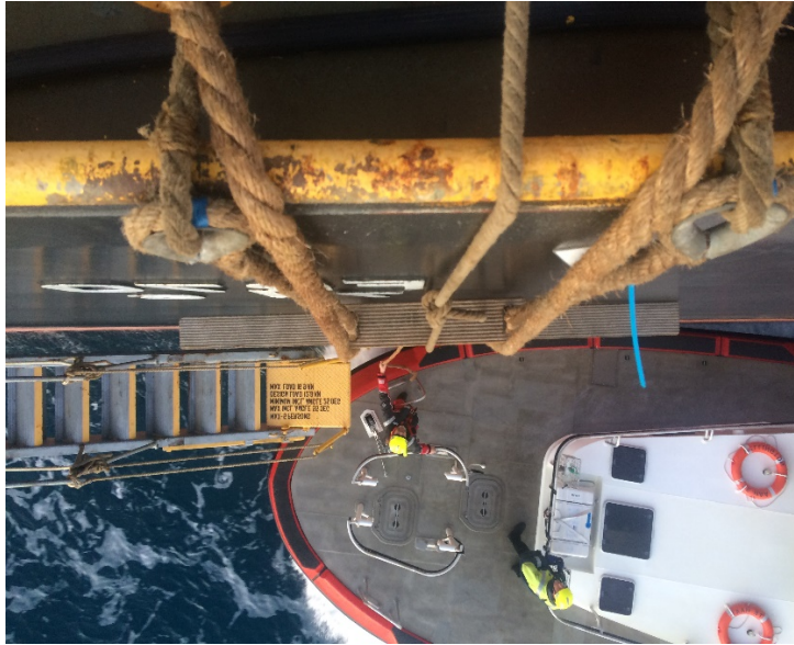
Figure 5 – Ladder weight is actually supported by the whippings of the thimbles

This picture shows side ropes terminating at thimbles below deck level. Lines through these thimbles run up to the deck where shackles are used to support the ropes. This was pointed out to the crew on deck, but they stated that a single line leading down to the top step was taking the weight! Definitely not compliant and a longer ladder is required so that side ropes can be secured directly on deck.