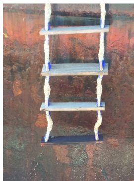
Cute – but dangerously non-compliant

We at CHIRP Maritime continue to be astonished at the poor level of seamanship regularly presented to us in these pilot ladder reports. We accept that there is no current good practice available on securing ladders but seafaring is about applying common sense with practical skills to solve problems. It's what we do, and it sets us apart from other professions. There is a right way to rig and maintain ladders that uses these skills and as we see so many deficiencies it leads us to ask the question - is the quality of basic training meeting the requirements of STCW? It would appear not. In fact, it seems to be getting worse as the years go by.