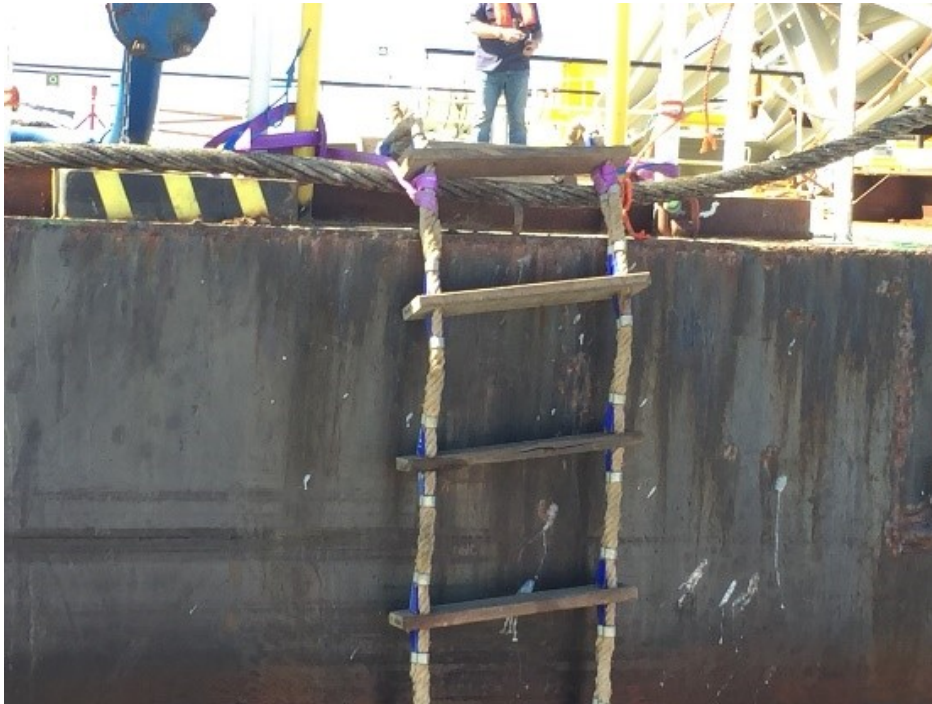
Figure 3 – Ladder supported by strops and not the side ropes

With Figure two, the weight is taken by an uncertified bracket and by the whippings around the chock above the step. Additionally, should the ladder jump for any reason there is the potential for a serious accident.