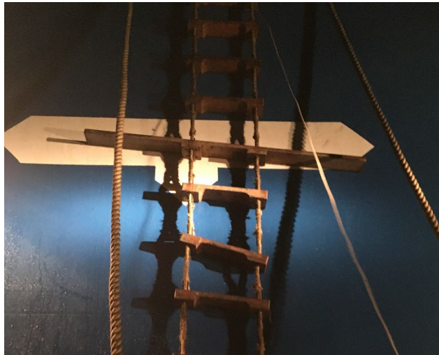
Figure 11 – The step on this ladder gave way whilst the Pilot was disembarking