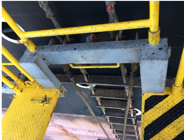
Figure 9 – Pilot has to lean back to gain access to trapdoor

Given the foregoing, it should be no surprise that pilots universally dislike these arrangements and, in many cases, wonder who approved them. Part of the worry is that the systems are roughly similar to pilot hoists, which have been banned for many years. Additionally, the gangways and their winch/wire assembly are not covered by the pilot ladder regulations. There is an assumption that all of these arrangements are Class approved. If so, then there is a disconnect between accommodation ladder and pilot ladder regulations and, in our opinion, this needs to be addressed. Above all, the actual practicality of conducting the operation in a safe manner should be taken into account at the design stage well before any Class approval – it's called Human Centred Design.