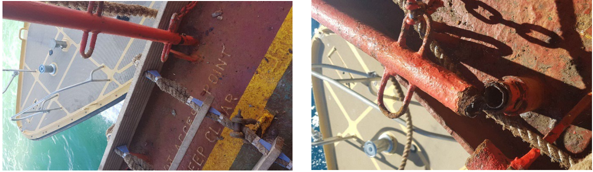
Figure 14 – Stanchion provided for manropes – but failed dramatically when crew on pilot cutter tested the weight