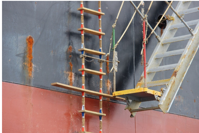
Figure 6 – Ladder not attached to hull

This picture shows side ropes terminating at thimbles below deck level. Lines through these thimbles run up to the deck where shackles are used to support the ropes. This was pointed out to the crew on deck, but they stated that a single line leading down to the top step was taking the weight! Definitely not compliant and a longer ladder is required so that side ropes can be secured directly on deck.