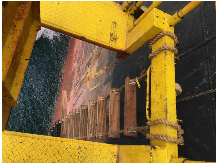
Figure 7 – Ladder does not extend 1.5 metres above the trap door – how do you transit from ladder through the trap door?

Invariably, problems are encountered when making the transition through the trapdoor with inadequate handholds. Ladders are found to have been rigged with the lower ladder attached directly to the accommodation ladder as shown below. This ladder did not extend 1.5 metres above the platform. Some vessels have made this a two-stage arrangement with a second ladder in order to try to achieve compliance, but this also poses issues.