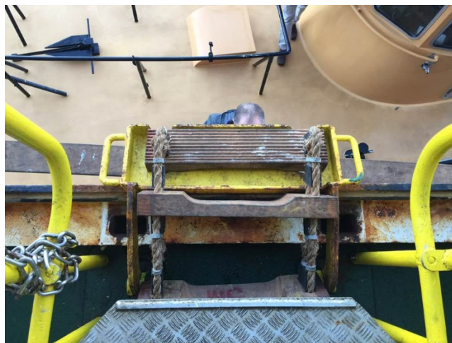
Figure 2 – Ladder weight supported by a bracket which the step fits into

In this example, the ladder had its weight effectively taken by the chocks. Whether they are plastic or wooden, chocks can be damaged if the shackles take the weight of the ladder directly against them. As it happens this example also resulted in the ladder being secured at the deck level in a manner which caused the steps to lie at an uneven angle. A cursory glance at the photo should be enough to tell you that this ladder is not fit for purpose and is (probably) not certified.