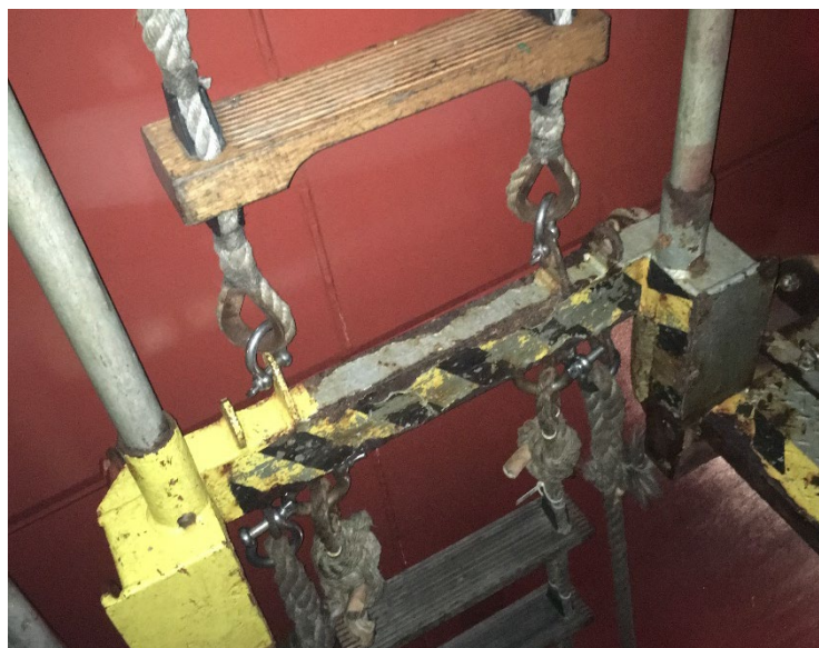
Figure 8 - Two stage non-compliant ladder – weight is not held by man ropes at all

A single length of ladder, lying flat against the hull and secured 1.5 metres above the accommodation ladder trapdoor is the requirement – this however often means that the pilot has to lean back in order to effect access through the trapdoor. This is illustrated in the following two pictures where the two-stage ladders are also non-compliant. Pilot ladders are suspended from the accommodation ladder frames rather than directly from their side ropes.