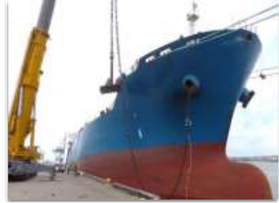
Photo 12: Fitting a new anchor and chain with mobile shore crane assistance