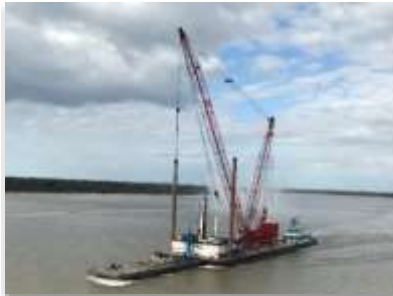
Photo 8: Typical crane and/or deck barge assistance