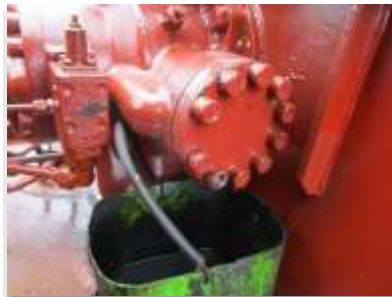
Photo 2: Ruptured motor housing to windlass experienced during attempted recovery of anchor