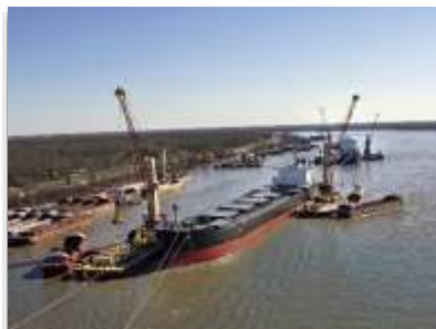
Photo 5: A typical midstream mooring facility (2)