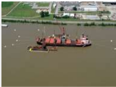
Photo 4: A typical midstream mooring facility (1)