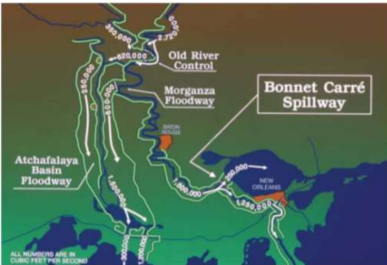
Floodways and flow distribution during major floods in the lower Mississippi River Valley.

Such incidents can prove very costly for vessel owners, charterers and their insurers with additional fees for tugs, pilots, crane barges and salvage efforts often amounting to several hundred thousand dollars. Claims resulting in third-party damages and/or terminal tariff fees 4 can often exceed one million dollars.