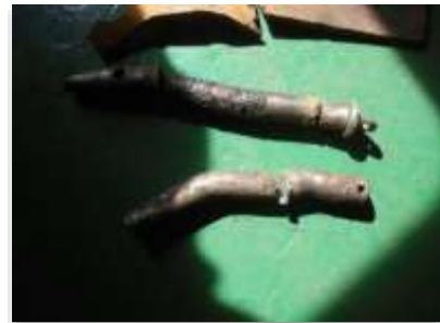
Photo 3: Failed stopper pins from the anchor windlass guillotine stopper