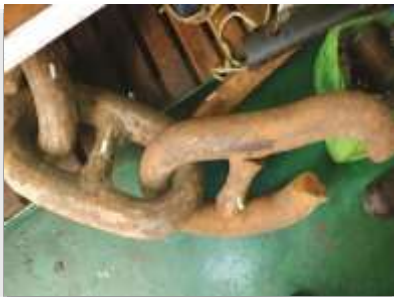
Photo 1: Failed common link to anchor chain resulting in loss of chain and anchor