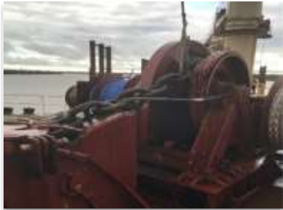
Photo 7: Proper securing of the anchor chain with disengagement of the gear reduces the risk of winch or motor damage