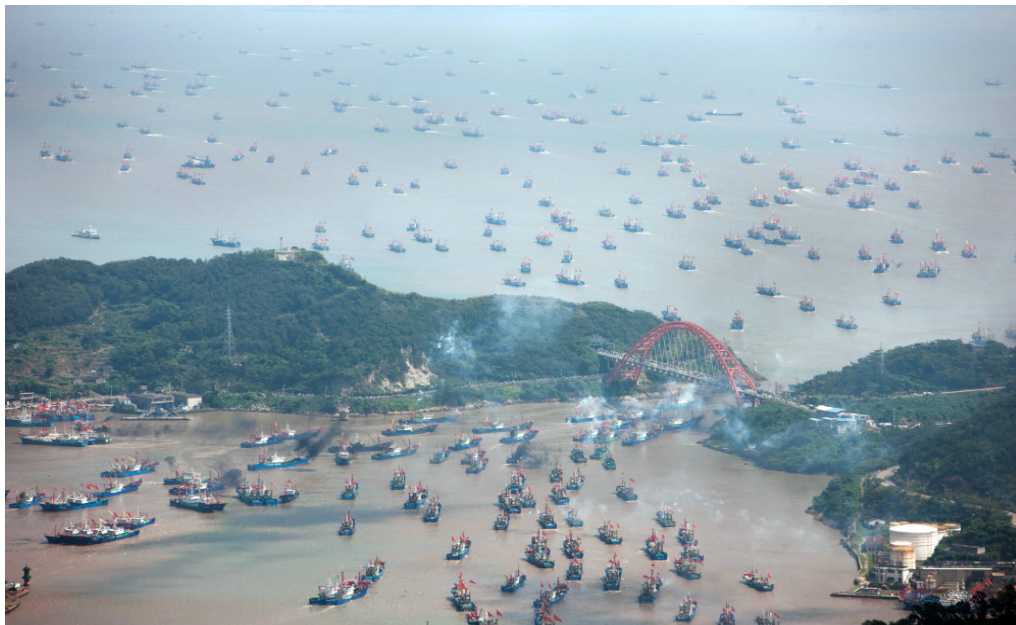
Fishing boats are proceeding to the fishing farms after fishing ban ends

Apart from the fog season in March and April, the period between August and October is another high-occurrence season of collision incident with fishing boats. Viewing the above, ships are suggested to pay more attention in the subsequent days immediately after the fishing season starts.